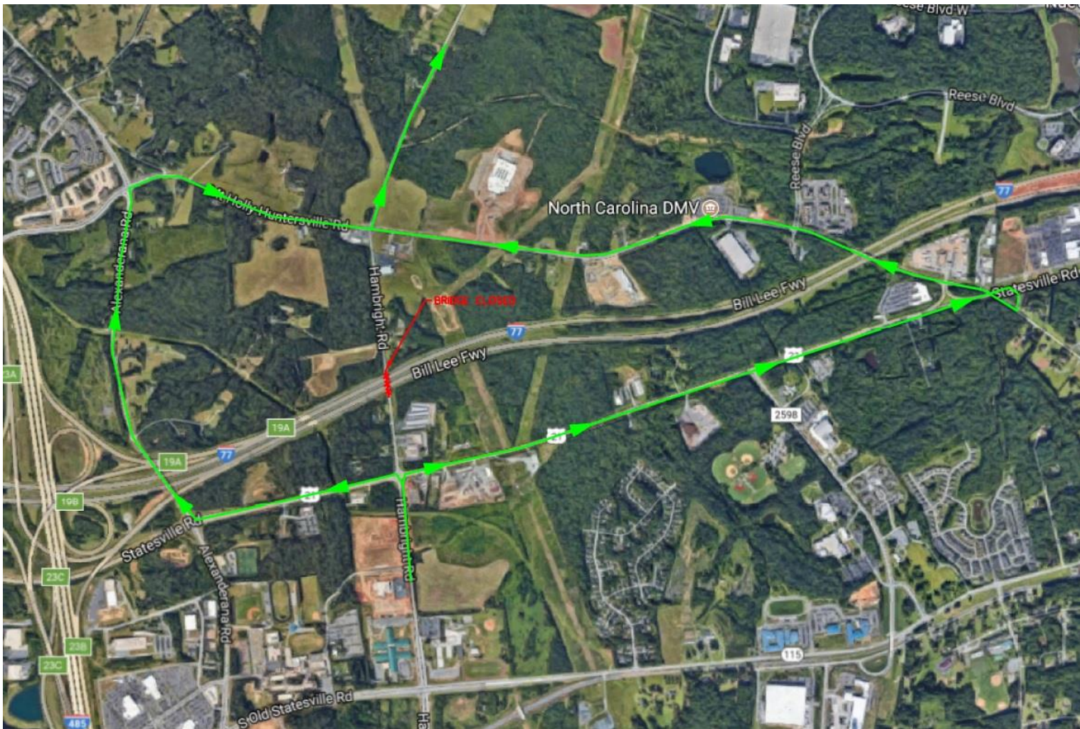
Hambricht Road Bridge Westbound Detour for Local Traffic