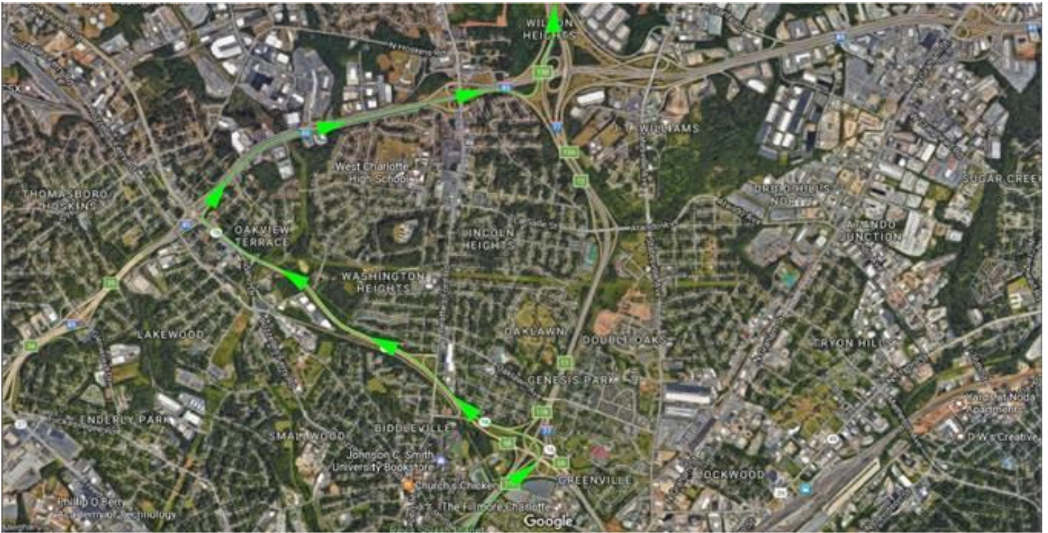
I-77 Northbound Detour